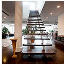
Gordon Gekko's New Protégé Slept Here