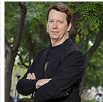
Sean Carroll: School Science and Time Travel