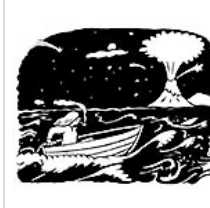
Op-Ed: Escape From the Jet Age

Home | World | U.S. | N.Y./Region | Business | Technology | Science | Health | Sports | Opinion | Arts | Style | Travel | Jobs | Real Estate | Autos | Back to Top